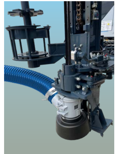
Reliable dust control system.