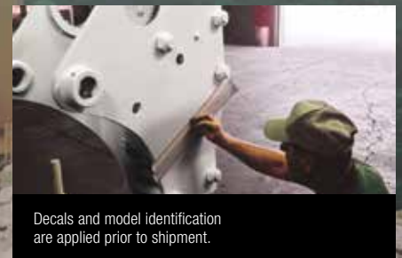
Decals and model identification are applied prior to shipment.