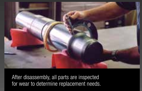
After disassembly, all parts are inspected for wear to determine replacement needs.