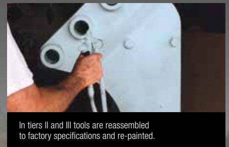
In tiers II and III tools are reassembled to factory specifications and re-painted.