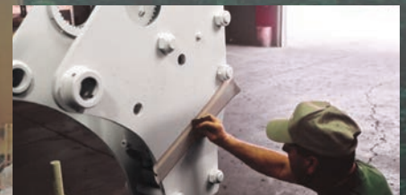
Decals and model identification are applied prior to shipment.