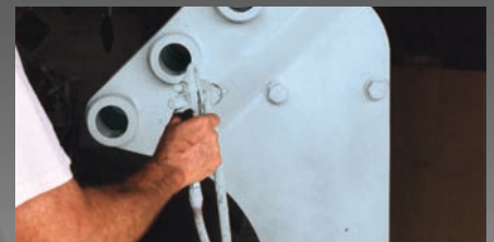
In tiers II and III tools are reassembled to factory specifications and re-painted.