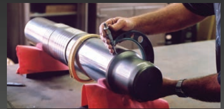
After disassembly, all parts are inspected for wear to determine replacement needs.