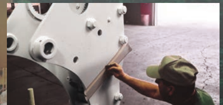
Decals and model identification are applied prior to shipment.