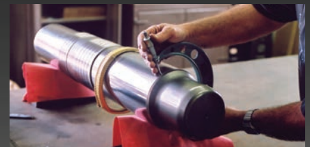
After disassembly, all parts are inspected for wear to determine replacement needs.